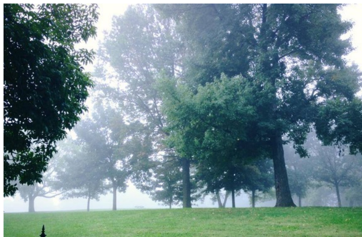
A foggy morning in Lafayette Park