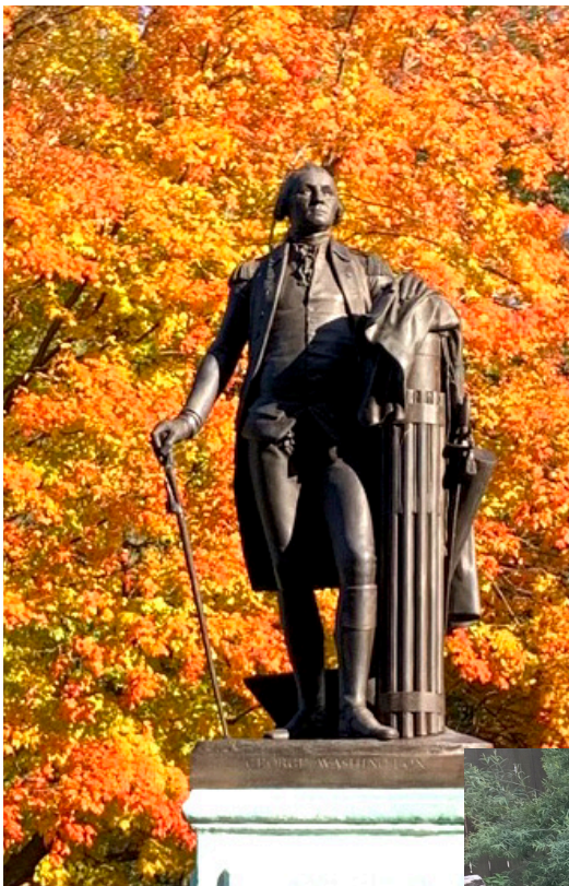
Washington statue Autumn 2020