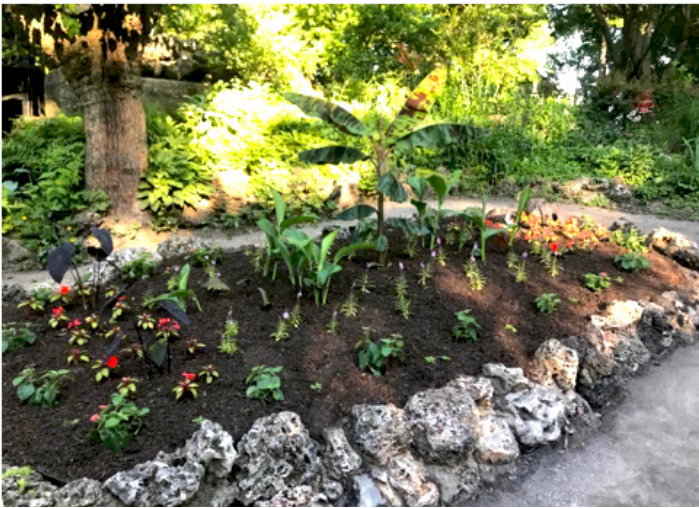
Two images of the island area in the Park Grotto showing it early in spring and then again after a summer of growth where the plantings are over the head of volunteer Michael Bushur.