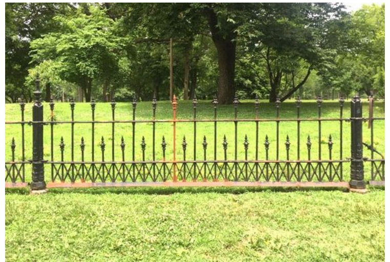
Section of fence along Lafayette Avenue after being repaired this June.

Do you need a program for your organization?