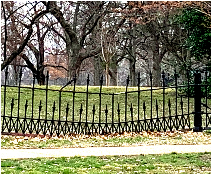
Section of fence along Lafayette Avenue after being hit by a fallen tree limb.