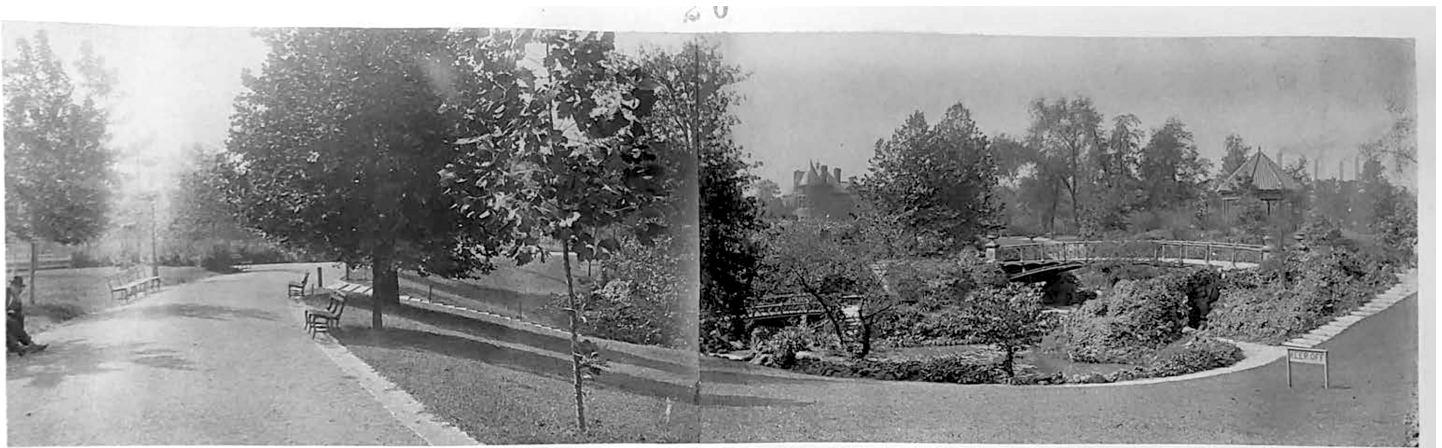
A black and white version of the same scene as in the photo above.