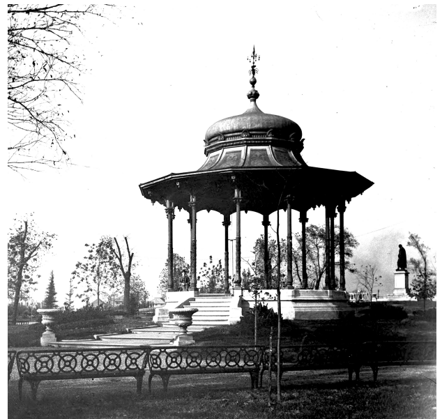
The rebuilt 1876 Music Stand after tornado of 1896