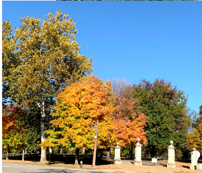
Southeast entrance to the Park, Autumn 2020