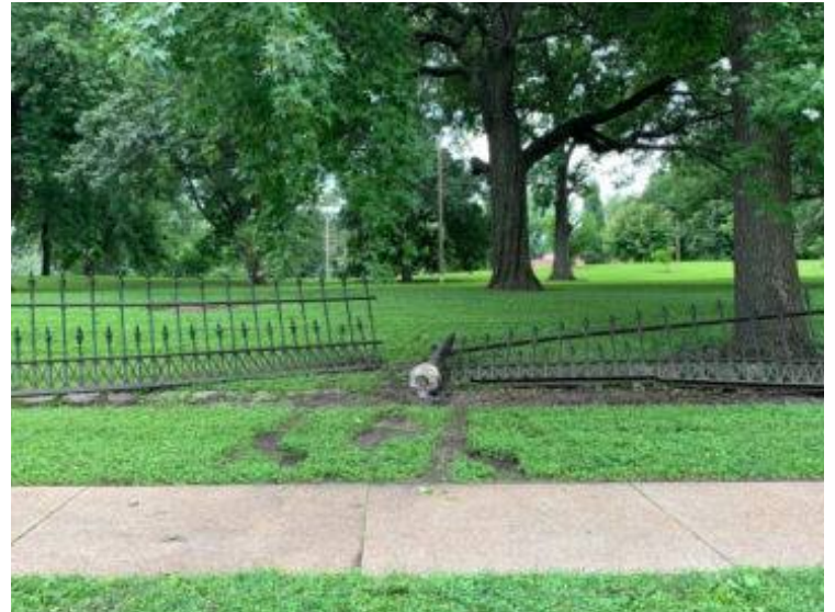
Section of fence along Park Avenue after being hit by a car.

The generosity of park lovers and neighbors alike enables the Lafayette Park Conservancy to make improvements like this.