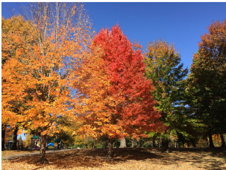
Lafayette Park trees showing autumn colors

Is there anyone left who underestimated the value of Lafayette Park to the neighborhood in 2020? It's been serving the usual function of a thirty acre strolling, running, dog-walking, playing, painting, picnicking getaway. This year, it's grown into some emergency duties as well, as a pressure relief for the confined or quarantined over a long year.