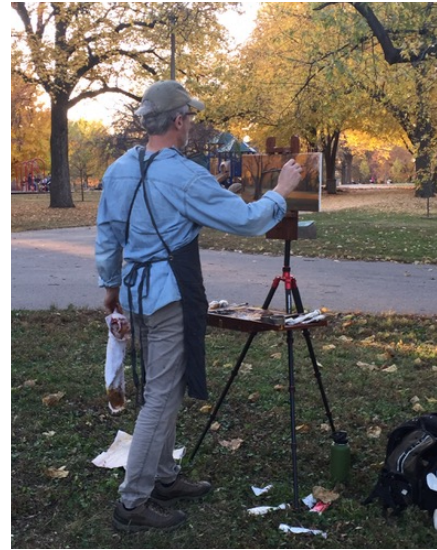
An artist at work in Lafayette Park

Join the Lafayette Park Conservancy; donate or perhaps volunteer a bit of your time, to keep and grow our neighborhood treasure. Check us out at www.lafayettepark.org