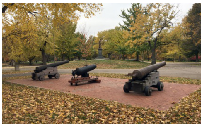
Revolutionary War Monument restoration. The LPC funded project took 9 years and about $30,000.

After many years of fundraising and working with restoration companies, the Revolutionary War Monument in Lafayette Park was completed by the Lafayette Park Conservancy. As a reminder this is a trophy monument consisting of three guns from the Acteon, a British Man-of-War sunk during an attempt to seize Charleston, South Carolina in 1776. An organization of former Union military officers purchased the guns at an auction in 1887 and presented them to the park in 1897. The wooden carriages deteriorated over the years and the guns were in need of restoration due to years spent in saltwater.