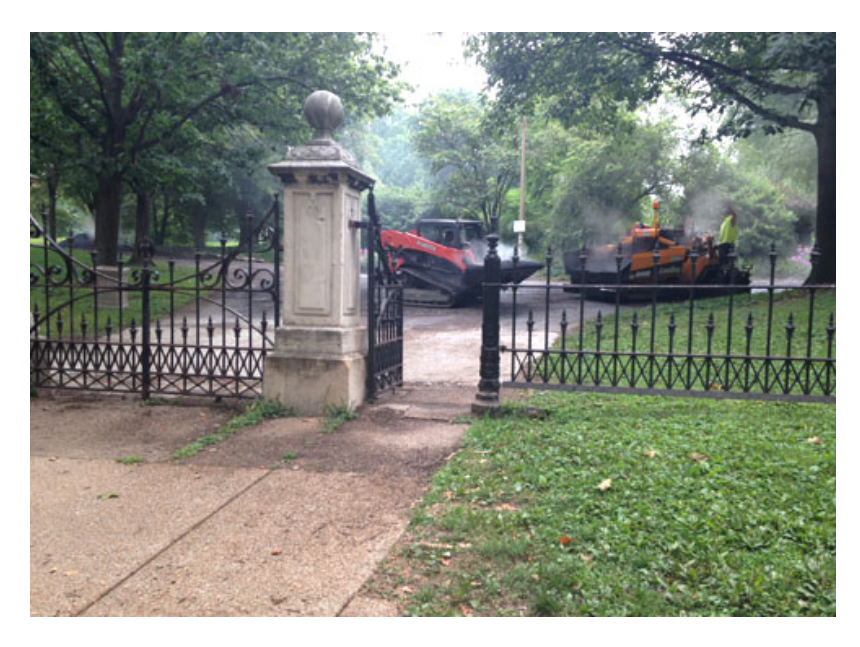
Paving machinery at work in Lafayette Park this summer. The final phase of the park pathways paving project was completed.

Take a stroll or a roll on the new paths and check out the many features of the park such as the Kern Pavilion, statues, lakes and gardens.