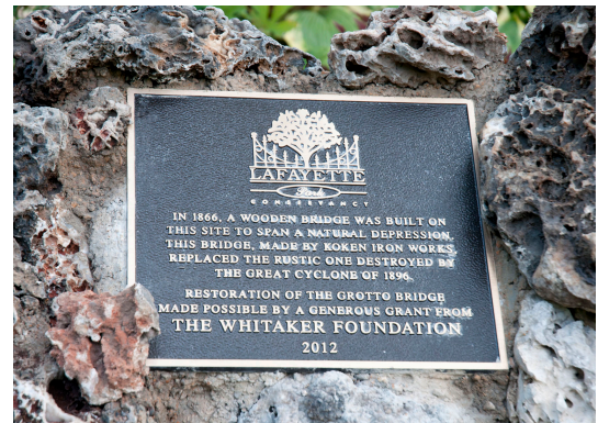
The plaque installed in the rock wall leading to the bridge was dedicated to the Whitaker Foundation.