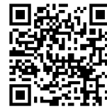
QR code for use with smartphones.

And we recently added one of those QR code things you see in many museums and stores. It looks like this: