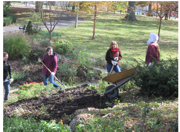
SLU students participated in a park workday as part of their Make A Difference Day community service program.