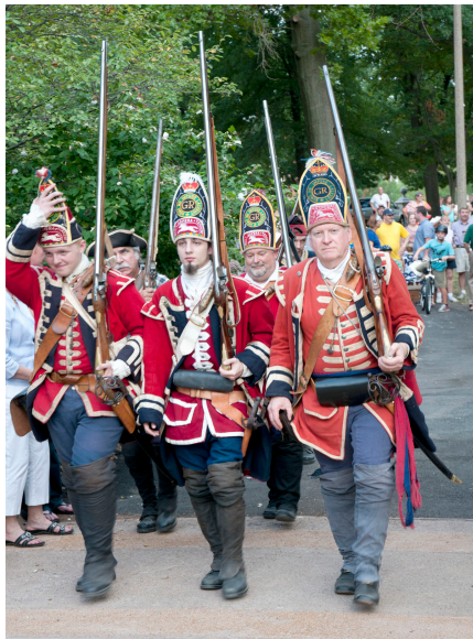
The First Royal Regiment of Foot fired guns and a cannon and then led the crowd across the newly opened bridge.