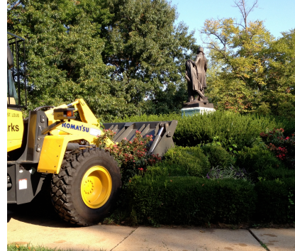
Removal of diseased rose bushes around the Washington statue. Red, dwarf crepe myrtle shrubs were planted to replace the roses.

With lots of help from the Flora Conservancy we accomplished a number of gardening projects this season. Even in the nearly unbearable heat. Well really it actually was unbearable, but we who garden are of sturdy stock. Here's a photographic story of some of our projects.